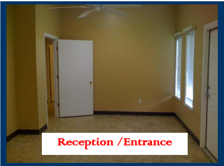
Reception / Entrance