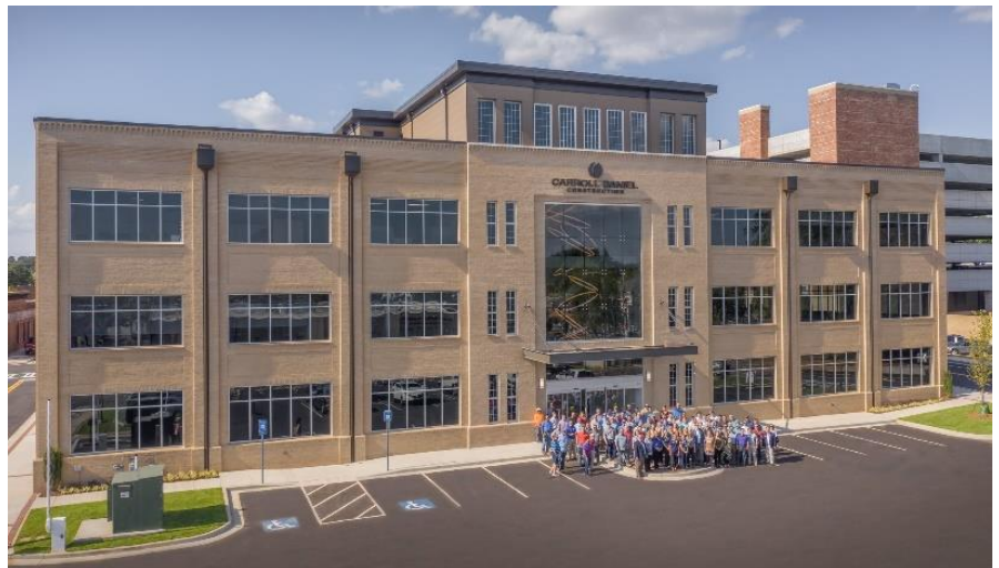
Carroll Daniel Construction completed its new, 50,000 sq. ft. headquarters in downtown Gainesville in fall 2019. The company occupies the top three levels of the building, while the bottom level features 10,000 sq. ft. of retail space.