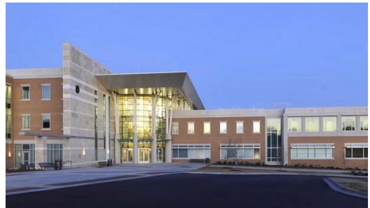
University of North Georgia – Gainesville Campus