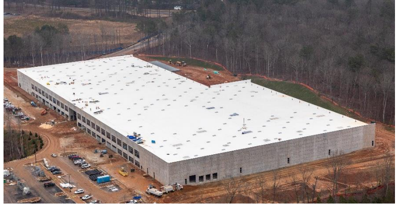
Fox Factory's new, 320,000 sq. ft. manufacturing headquarters is currently under construction in Gainesville Industrial Park West. The building is being completed in phases and will be finished in August 2020.