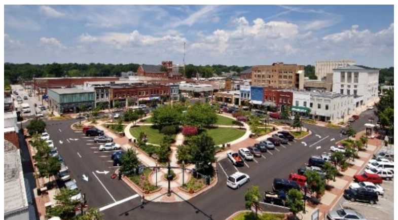
Gainesville’s Downtown Square has Main Street USA designation and offers unique dining and shopping experiences