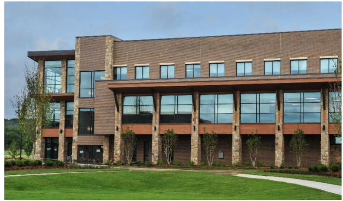
Lanier Technical College – Gainesville Campus