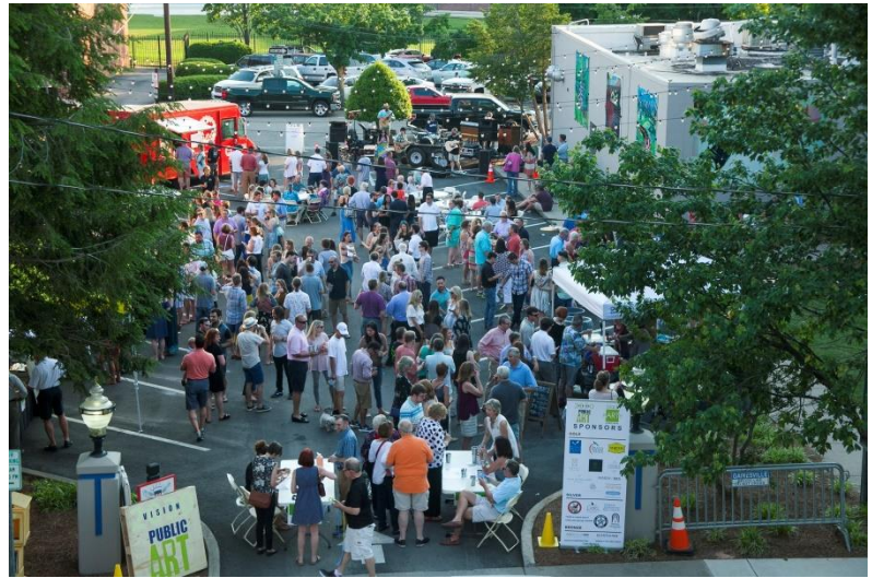
Vision 2030's Public Art Block pARTy features local artists and raises funds to purchase public art displays for the community. The next Public Art Block pARTy will be Friday, May 8, 2020 from 6 to 10 p.m. in The Royal Space (parking lot between Collegiate and Hunt Tower) in Downtown Gainesville.