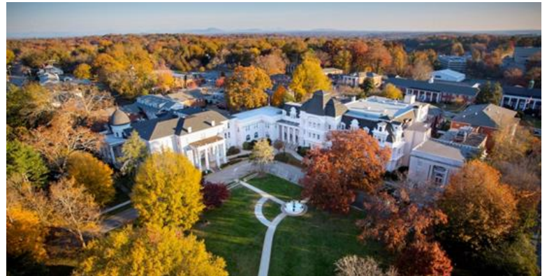
Brenau University – Gainesville Campus