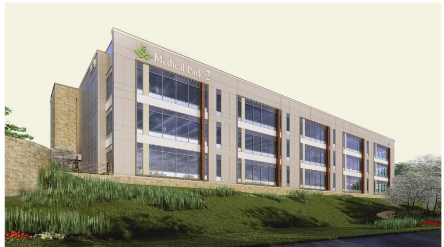
Northeast Georgia Health System's Medical Park 2 is currently under construction. The 72,000 sq. ft. medical office building will open along Jesse Jewell Parkway in July 2020 and will be home to the Graduate Medical Education (GME) program, several NGPG practices and a new retail pharmacy.