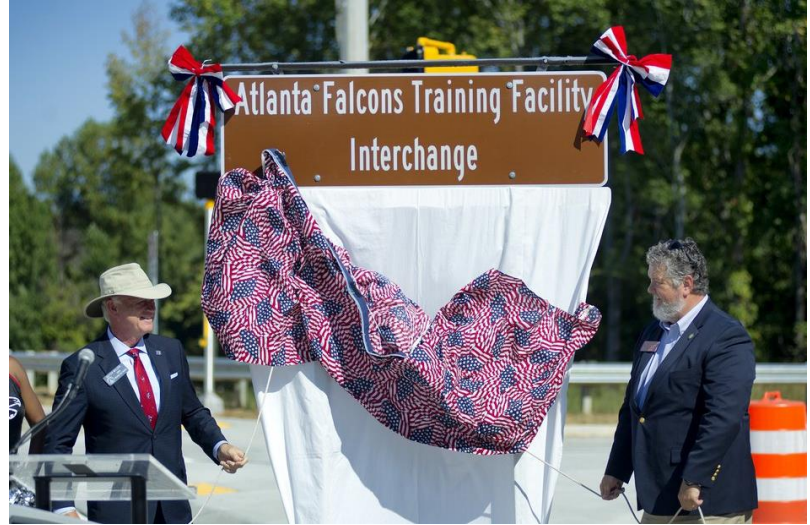
Senator Butch Miller and Representative Emory Dunahoo, Jr. unveiled the Exit 14 "Atlanta Falcons Training Facility Interchange" in fall 2019.